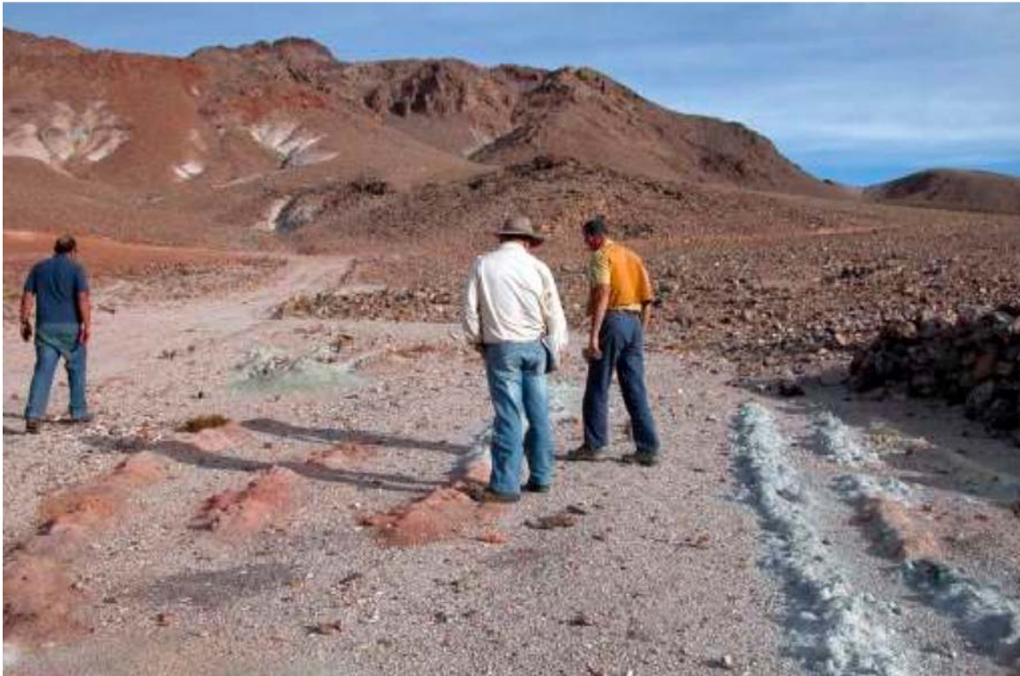
Figure 2: Old Kennecott RC hole in advanced argillic alteration on the northwest side of Cerro Humito. The advanced argillic alteration can be seen higher up the slope below the dark bluffs of massive vuggy silica.

Humito is located in the centre of a broad NNE–trending structural corridor bounded by the Atacama Fault to the east and the Domeyko Fault system to the west. This zone separates the Coastal and Pre-Andean mountain ranges and hosts a number of important deposits including the El Salvador, Damiana and Caballo Muerto deposits in addition to copper silver epithermal vein mineralisation of the Inca de Oro district.