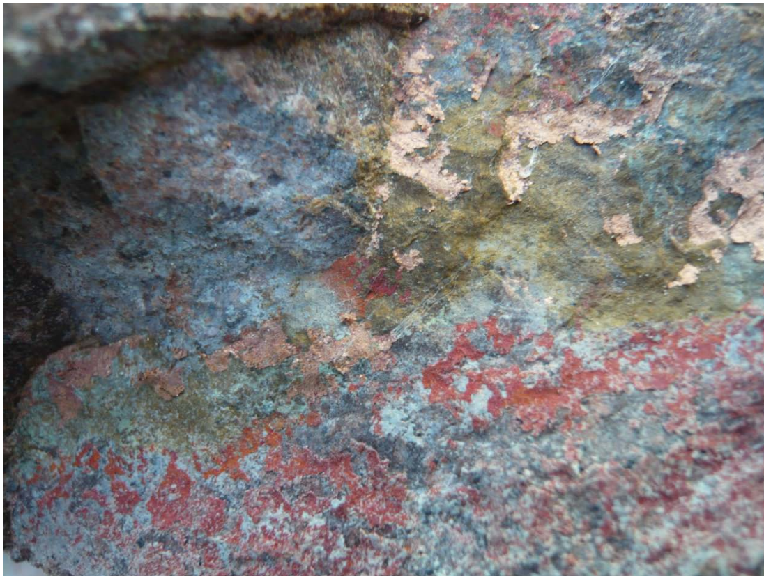
Figure 4. MDD006, 82 metres; Native Copper in top right and reddish Cuprite (copper oxide) at bottom of core sample in the footwall of the sulphide ore zone.