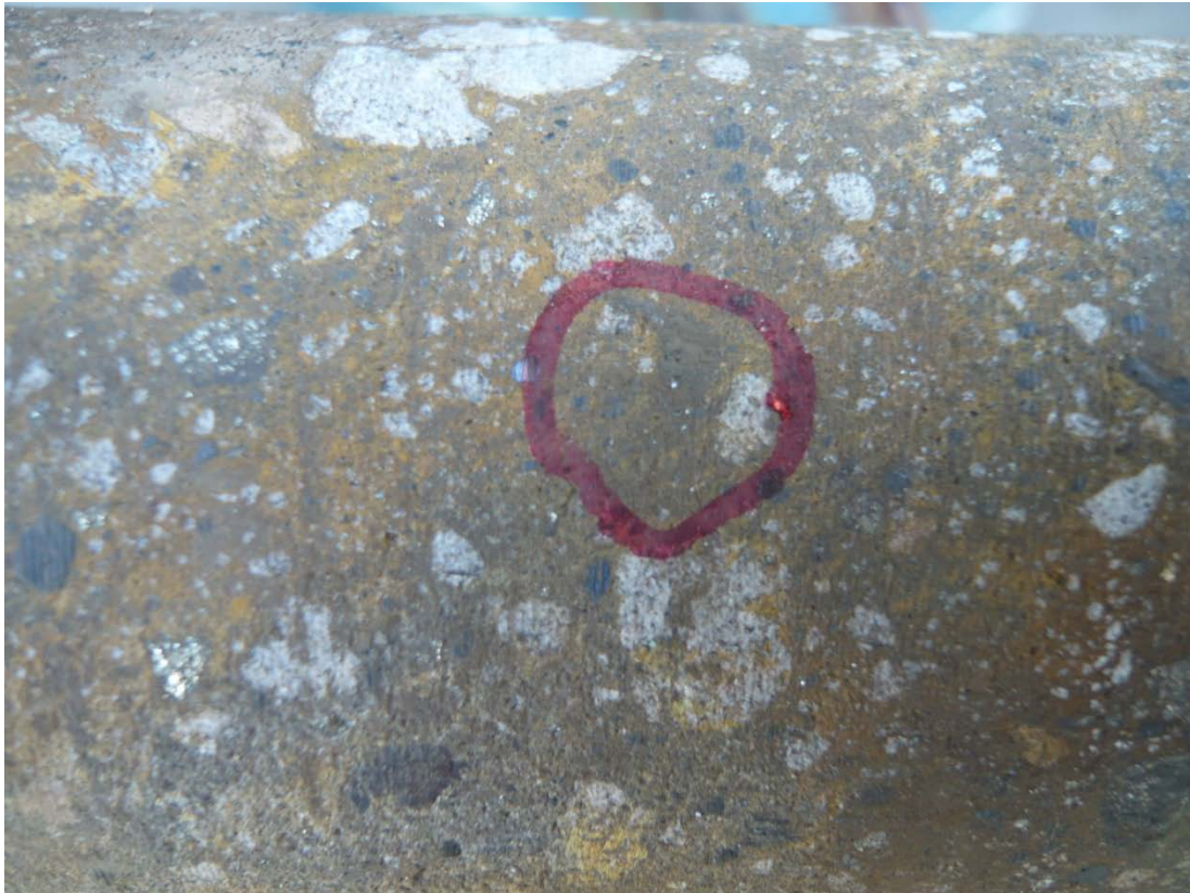
Figure 3. MDD006, 62.1 metres; Black blebs are chalcocite in iron oxide breccias.