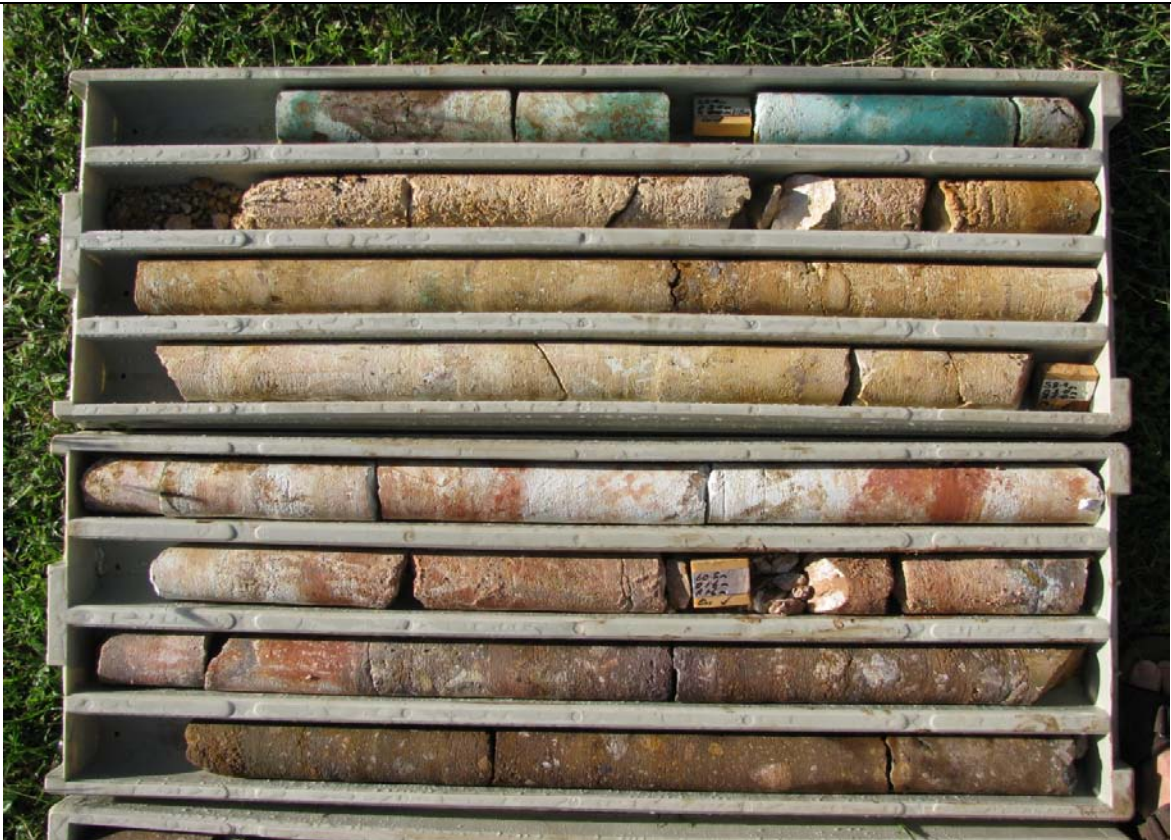
Figure 1. MDD006 – Core recovered in the target breccia from 55.5 metres and continues at depth beyond 62 metres as shown. Yellow brown rock in bottom metres is supergene Chalcocite (Copper Sulphide) breccia from 60.5 metres confirms the extension at depth of the Mt Dorothy sulphide breccia.

CYU's Managing Director Jason Beckton, said "These results are visual and therefore we will not speculate on the copper grade but confirm the strength of the system 50 metres deeper from previous drilling. Assay results are pending. This is confirmation that the supergene chalcocite zone is open and on completion of this hole we will continue to target this zone at depth."