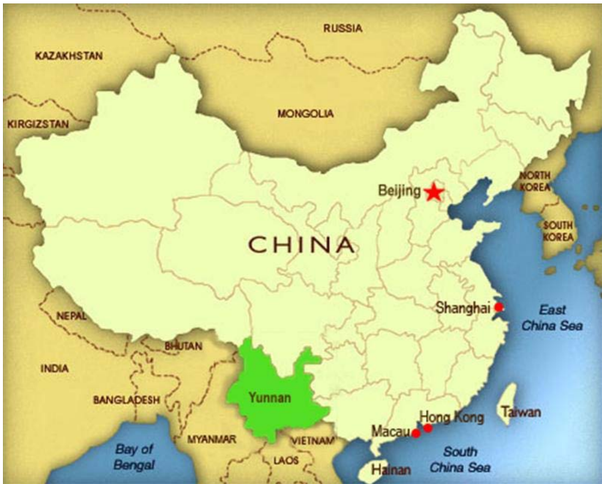
Figure 1. Map depicting location in southern China of Yunnan Province, prospective for porphyry and volcanic massive sulphide copper deposits.