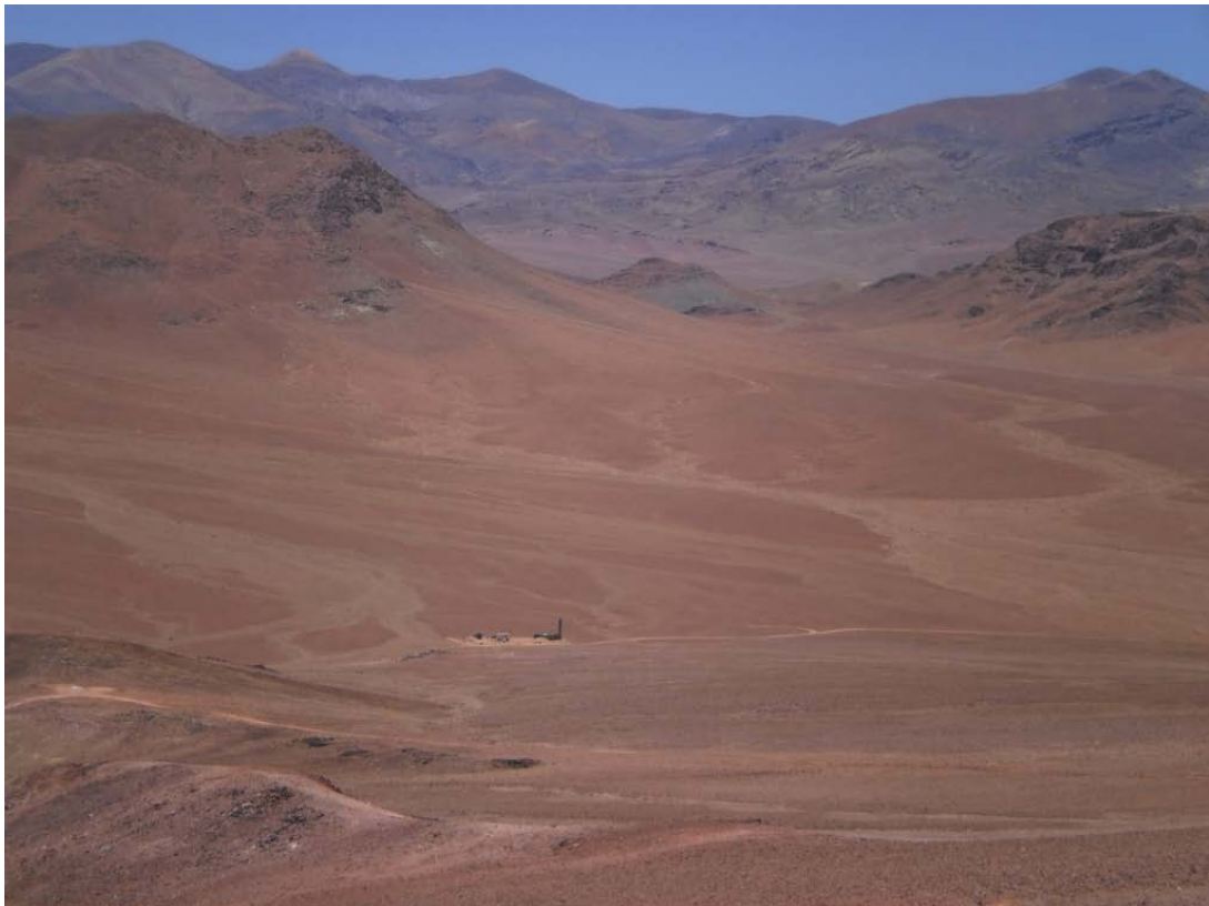
Figure 2. All targets are under shallow cover with ground magnetics completed on the project area for the first time resulting in immediate targets. Rig is in left foreground in the gravel plain adjacent to the Humitos alteration system on CYU 100% owned tenure.

The Humitos project is a classic example of a well preserved high level porphyry system displaying normal porphyry alteration patterns including a silica cap. Drilling proposes to test potential for a secondary enriched copper zone at depth.