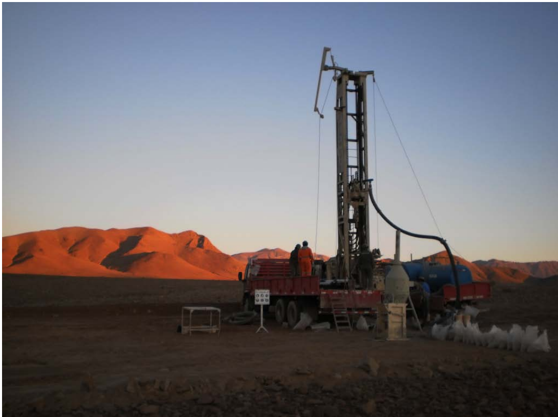
Figure 1. RC rig commences first of nine RC holes to test porphyry copper targets under gravel cover on the flanks of the Humito alteration system in Region III, Chile.

The Humitos project consists of a number of undrilled geophysical and geochemical anomalies including an untested supergene horizon in the most prolific copper belt in the world, the Chilean Cordillera. The project is located ten kilometres south of Pan Australian and Codelco's Inca de Oro project (259Mt @ 0.47% Copper) in the Copiapo District, Region III, Chile.